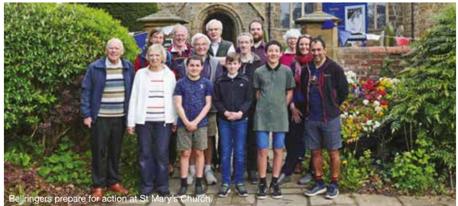
Bellringers prepare for action at St Mary's Church.