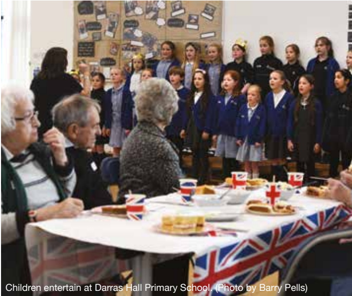
Children entertain at Darras Hall Primary School.