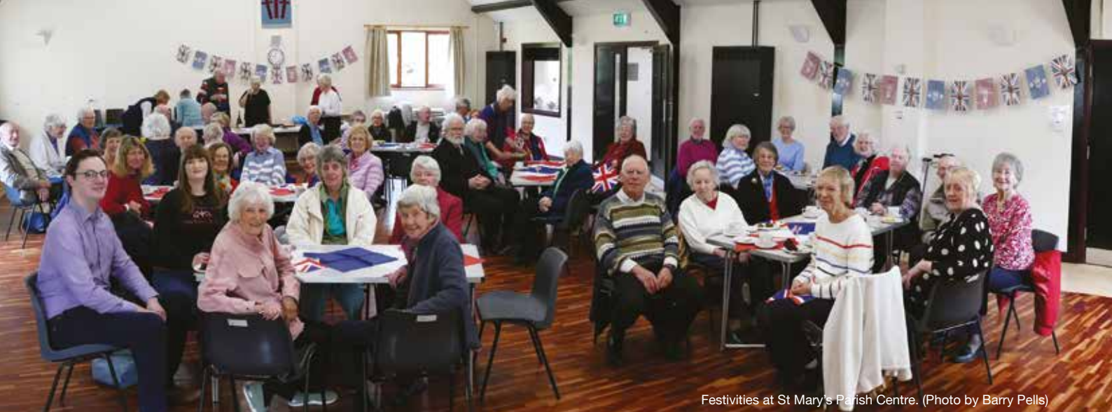
Festivities at St Mary's Parish Centre.