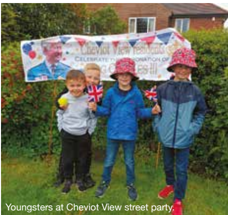
Youngsters at Cheviot View street party.