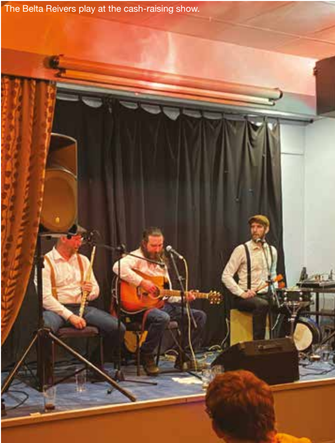
The Belta Reivers play at the cash-raising show.

Music was more than the food of love when a Geordie and Irish folk trio played a sell-out show at a popular Ponteland venue.