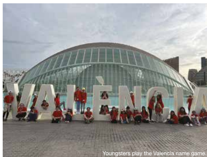
Youngsters play the Valencia name game.