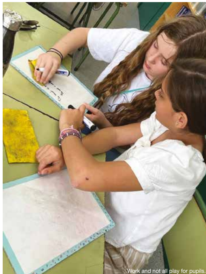
Work and not all play for pupils.