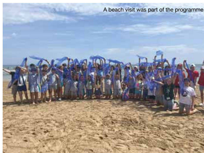
A beach visit was part of the programme.