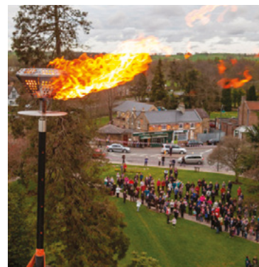
The Coates Green floral display and beacon for the Queen's 90th birthday celebrations in 2016.