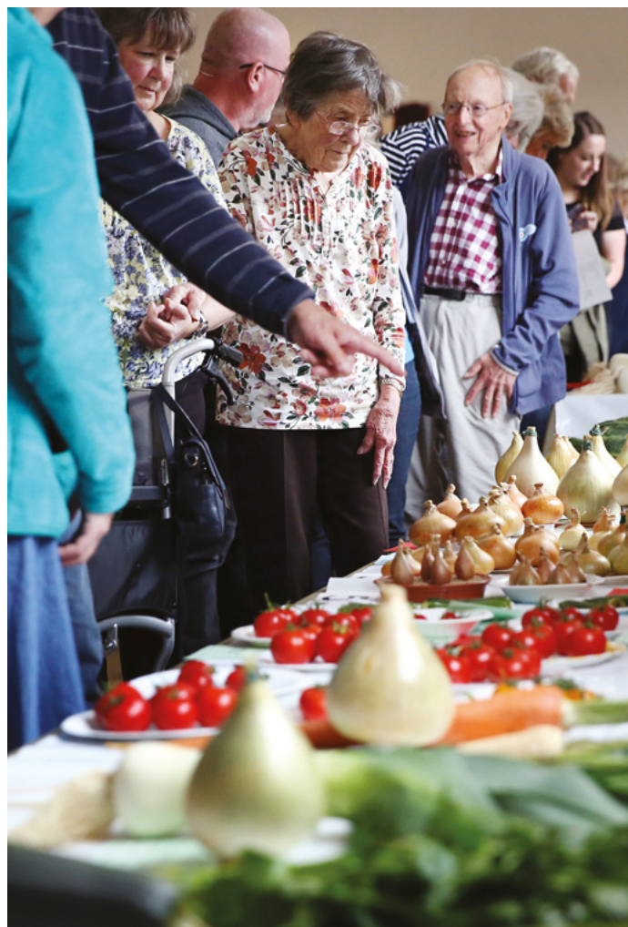
Visitors admire the exhibits at the Flower Show in 2019.