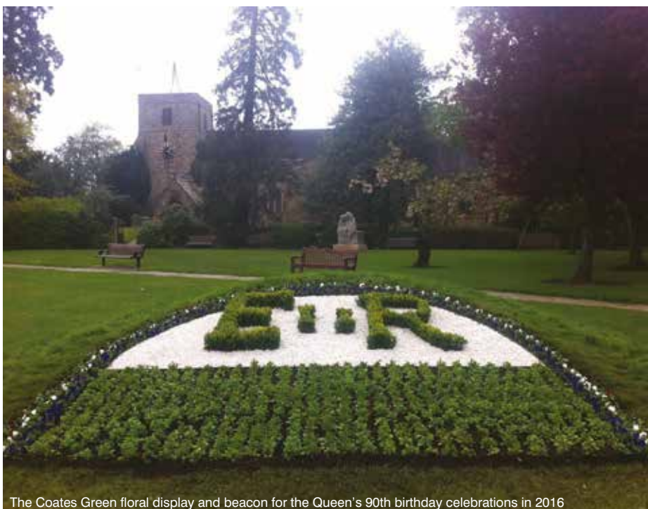
The Coates Green floral display and beacon for the Queen's 90th birthday celebrations in 2016