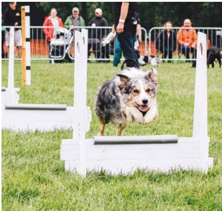
One of the performing dogs from last year's show.

The 2022 festival is also welcoming interested businesses who may want to come on board as a headline sponsor. Trade stand applications can be made via the website northeastdogfestival.com .