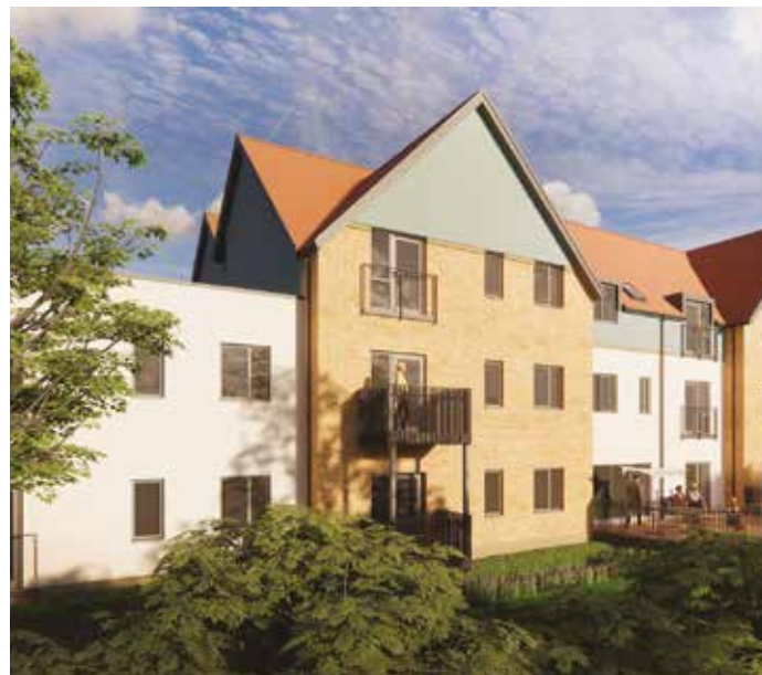
Demolition work on the old Athol House and an artist's impression of how the new Athol Court will look on completion.