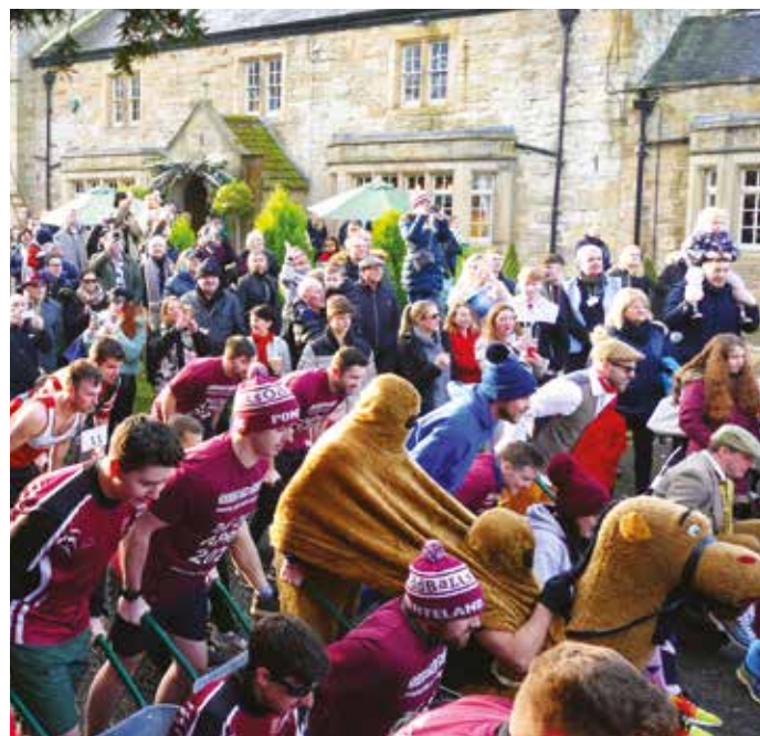
Competitors in the 2020 race.

For more details on both events visit the Rotary Ponteland Facebook page or website rotaryponteland.org.uk .