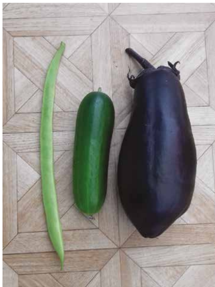
An entry in the vegetable collection category