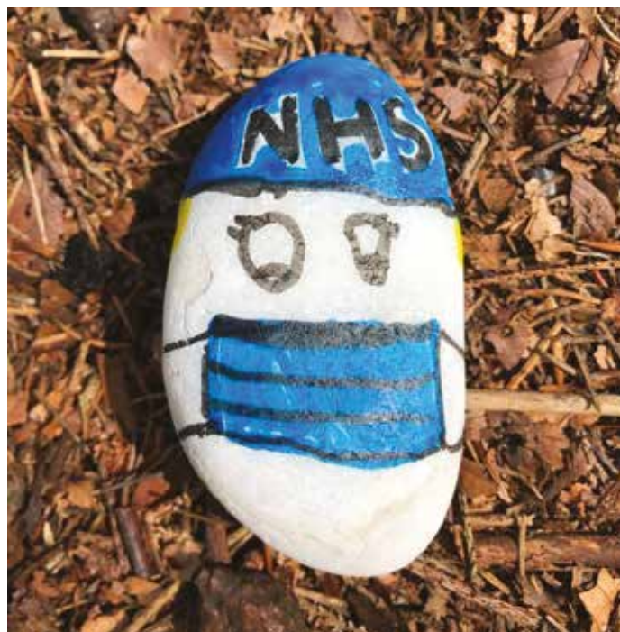
Finn Cassidy - A decorated pebble Olympic theme under 9 years (1st place)

The entries and results can be viewed at pontelandflowershow.co.uk