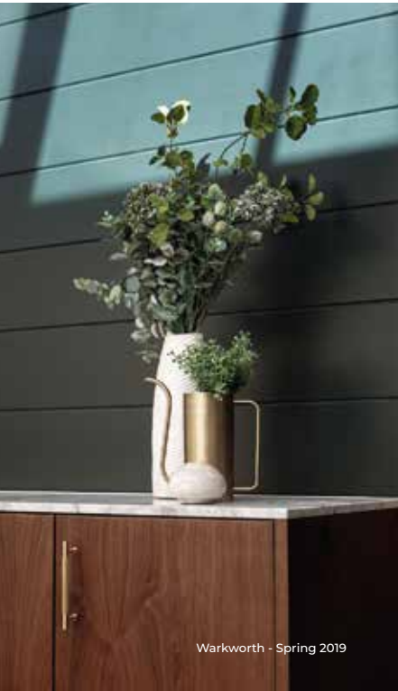
Warkworth - Spring 2019