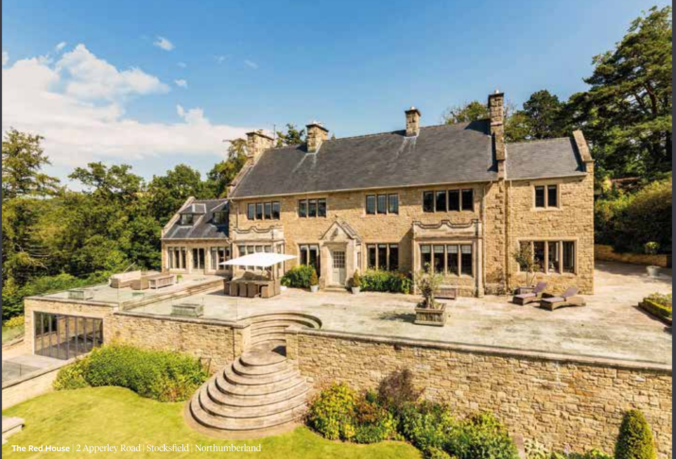
The Red House | 2 Apperley Road | Stocksfield | Northumberland

When it matters most, only the best will do