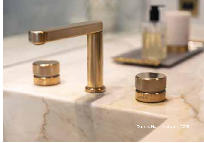
Darras Hall - Autumn 2019