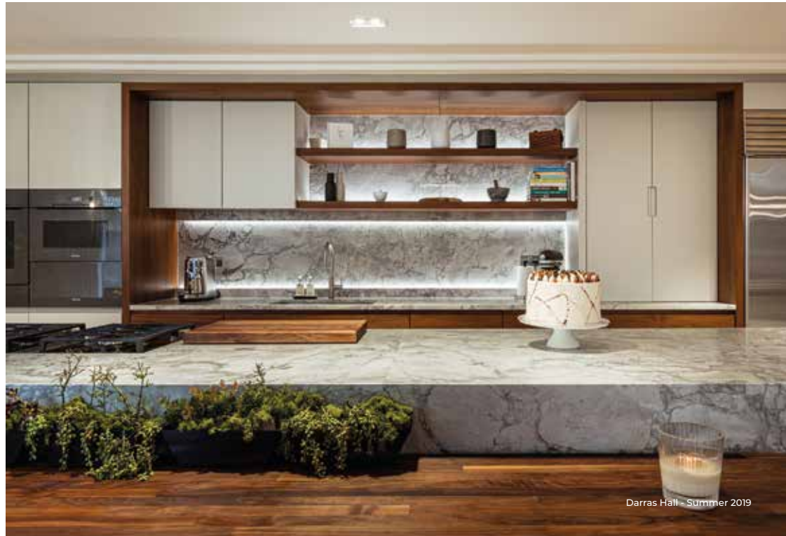
Darras Hall - Summer 2019