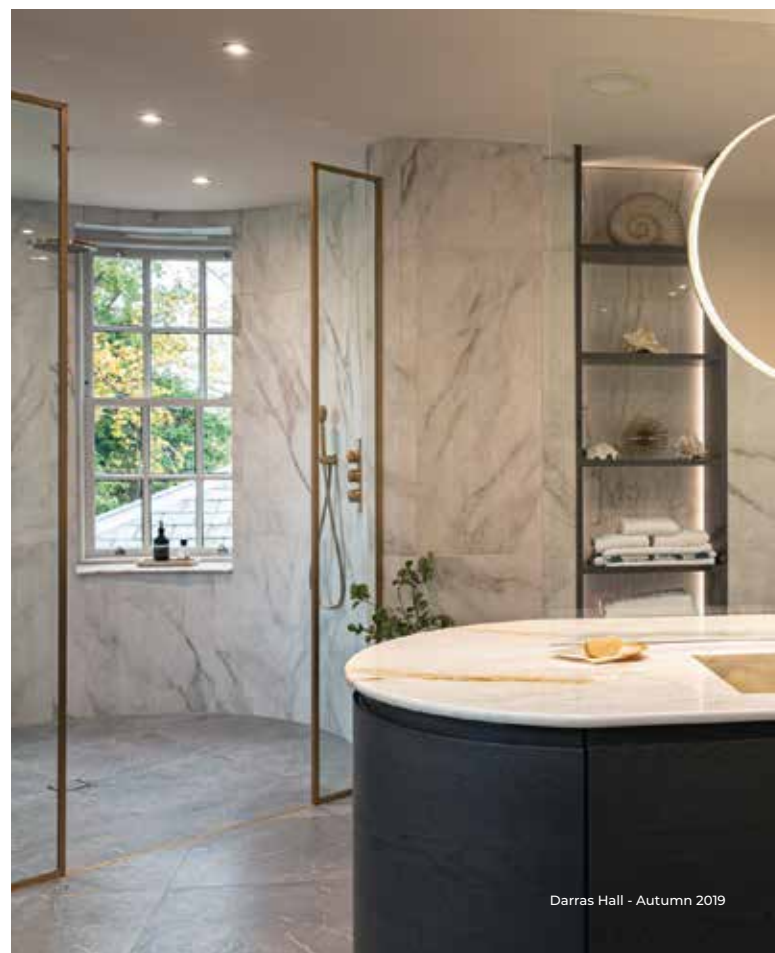
Darras Hall - Autumn 2019