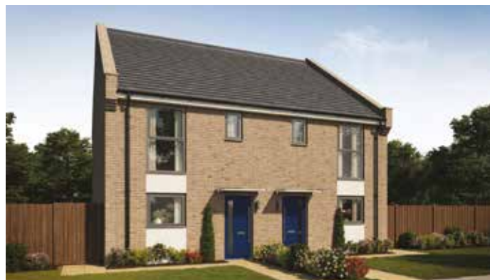
A computer-generated image of The Oxalis house-type at Ashberry Homes' Church View.

For more information on the discount market value scheme, visit ashberryhomes.co.uk or call the sales team on 07976 205211.