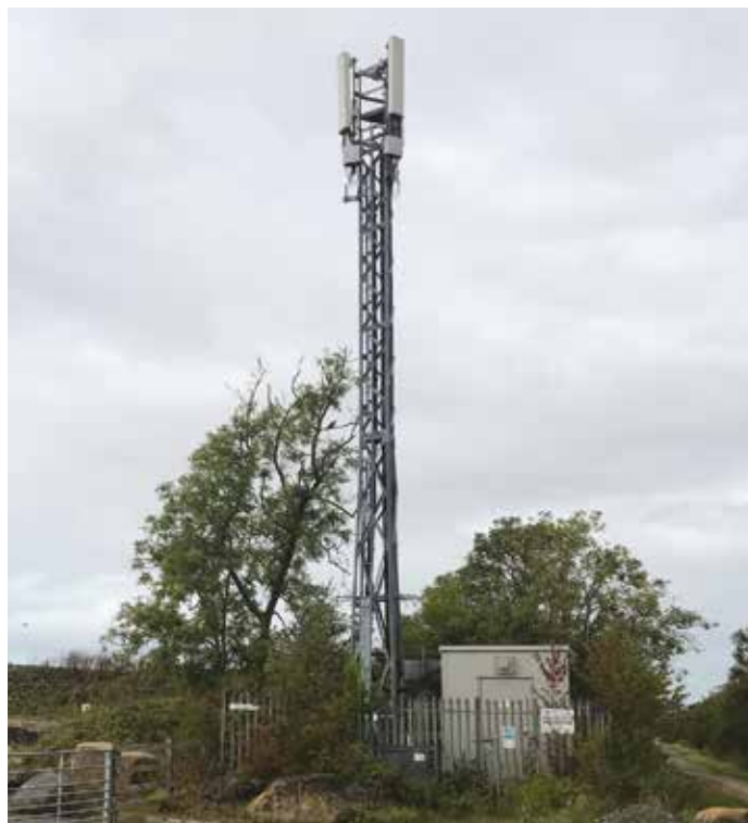
The existing phone mast could be replaced by a 20m-high tower

The current installation sits adjacent to mature tree cover, which partly screens it and covers all the ground-based equipment.