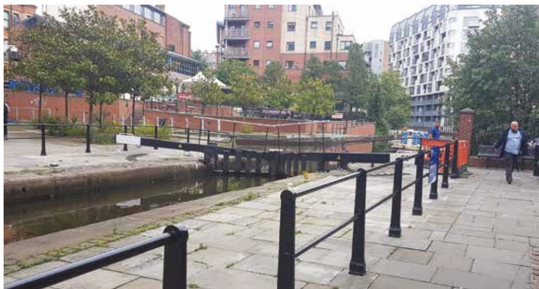
Part of the newly installed canal safety barriers in Manchester

An independent review, which confirmed 28 water-