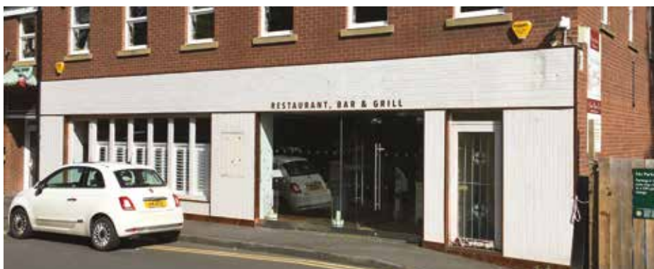
The Branches restaurant in Ponteland

And Keith Cazely said: "Absolutely shocked - never anything but great food & super service. Sorry but Jesmond not ideal."