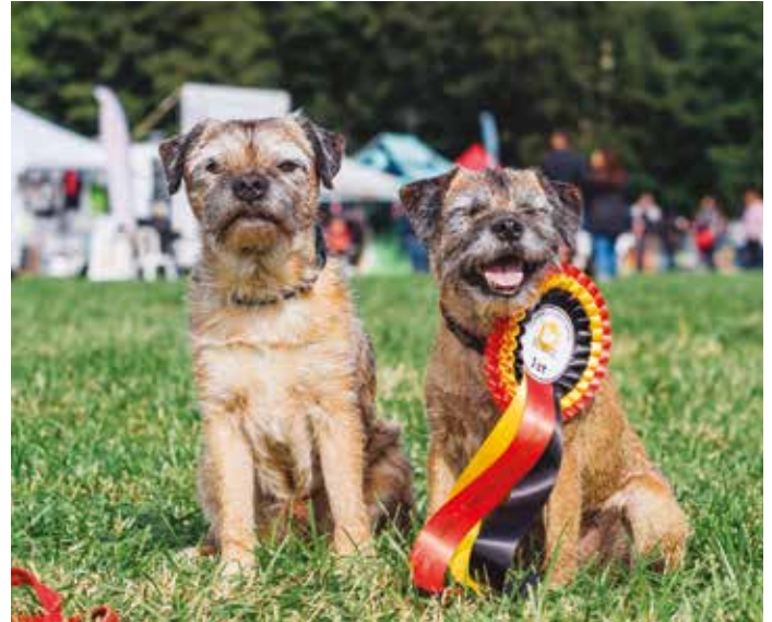
A pedigree chum shows off its rosette