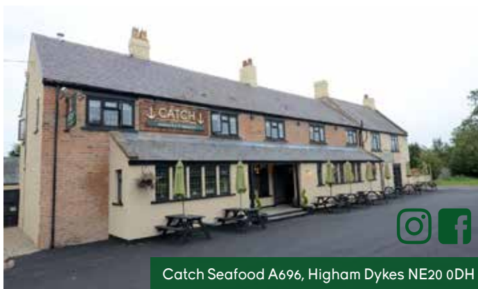
Catch Seafood A696, Higham Dykes NE20 0DH