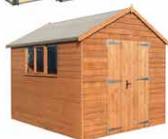
Apex sheds - from only £289