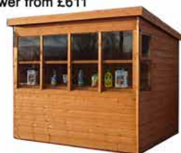
Sunflower from £611