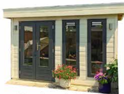
Log cabins - from only £1566