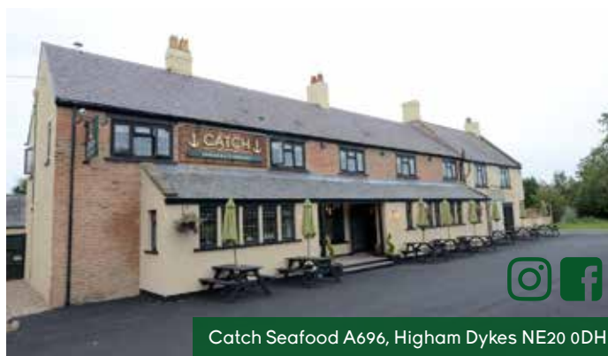
Catch Seafood A696, Higham Dykes NE20 0DH

27 Broadway, Darras Hall, Newcastle, NE20 9PW Tel: 01661 820 700 | www.dulais.com