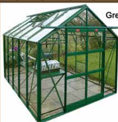
Greenhouses - from only £288