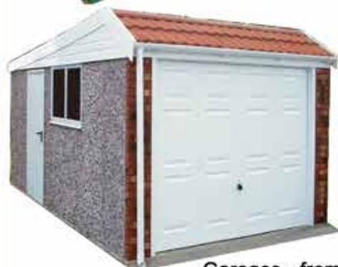
Garages - from only £1657