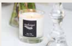
Fig & Lily...

teelangó has launched with three fragrances that burst with modern scents: