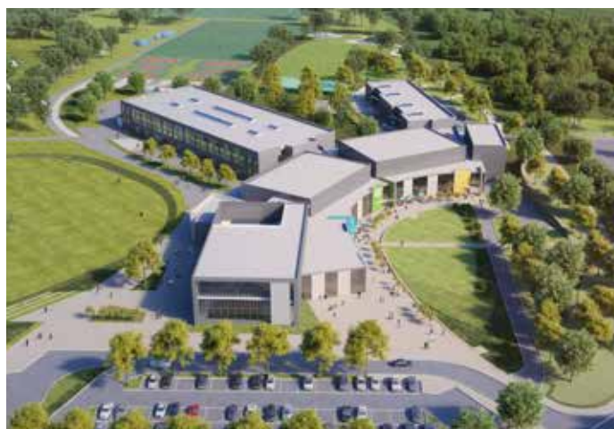
A visual of the new combined primary and high school and leisure facility.

"In doing so, the proposal is considered to create a 'once in a lifetime opportunity' for