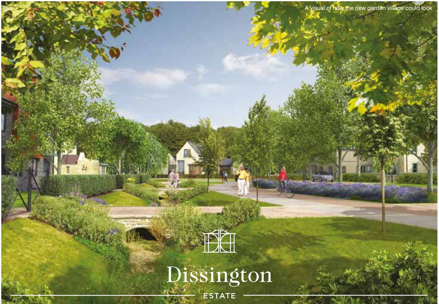
A visual of how the new garden village could look