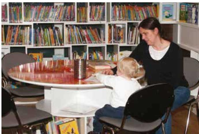
Library launch