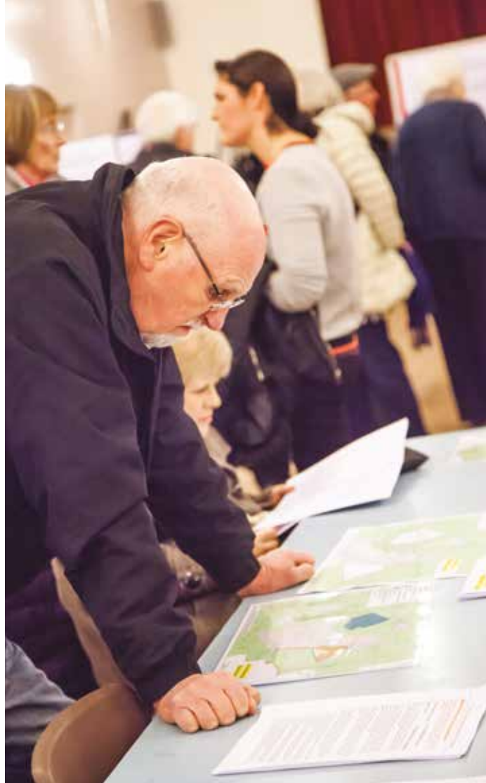
Photo from the drop-in event.

Examination by a Government inspector can then be expected during mid to late summer 2017 and formal 'adoption' in December 2017.