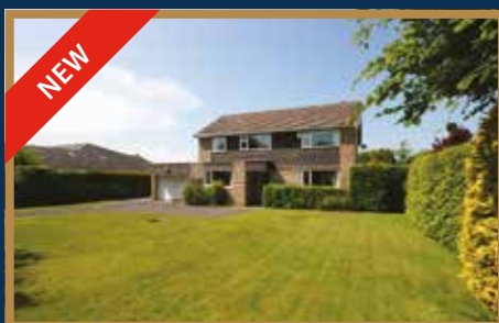
Hadrian Court, Darras Hall