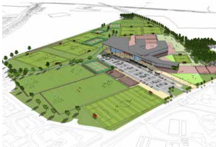
The latest visual from NCC for a new combined primary and secondary school.

This is because parents will under the new dual system be able to choose whether at Year 5 to move their children from a primary school to Ponteland Middle School.