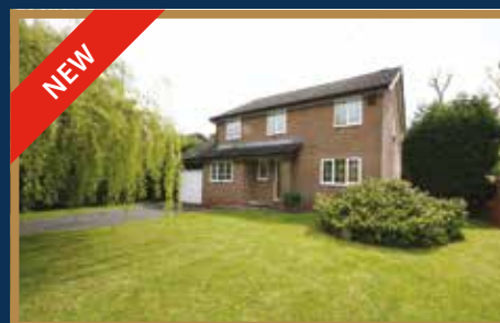
Westsyde, Darras Hall