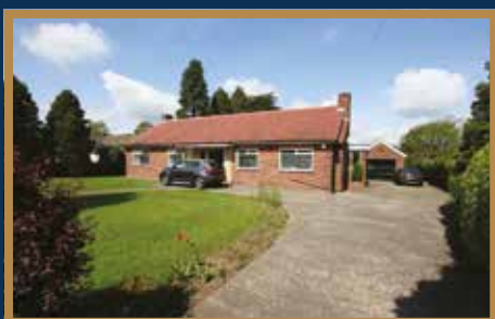
Middle Drive, Darras Hall