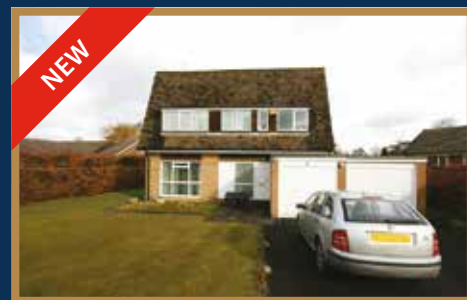
Parklands, Darras Hall