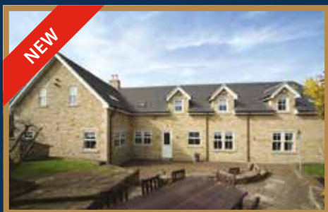
Wood Green, Medburn