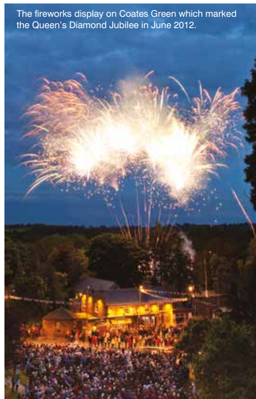
The fireworks display on Coates Green which marked the Queen's Diamond Jubilee in June 2012.