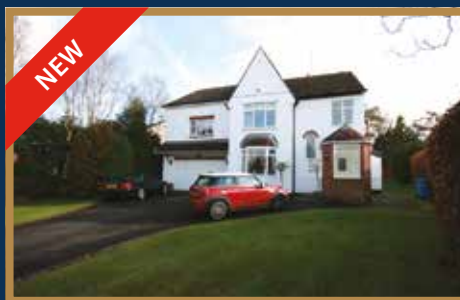
Middle Drive, Darras Hall