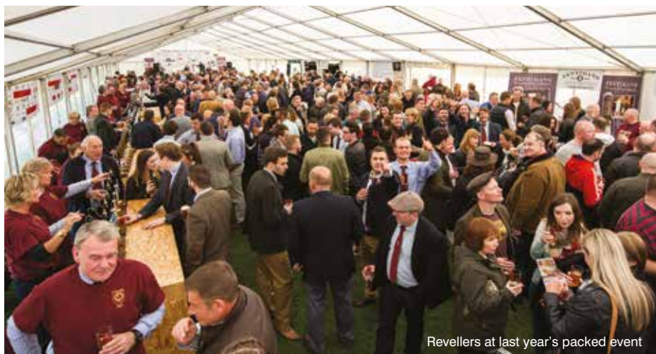
Revellers at last year's packed event

Music on the second day, which coincides with Ponteland's last home game of the season against Consett, comes from Ponteland Community Wind Band, North Star and the headline band for the Saturday evening are the very popular 'Proper Boys'.