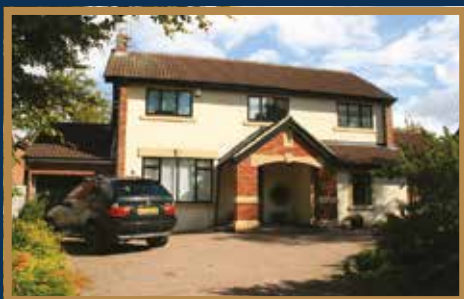
Western Way, Darras Hall