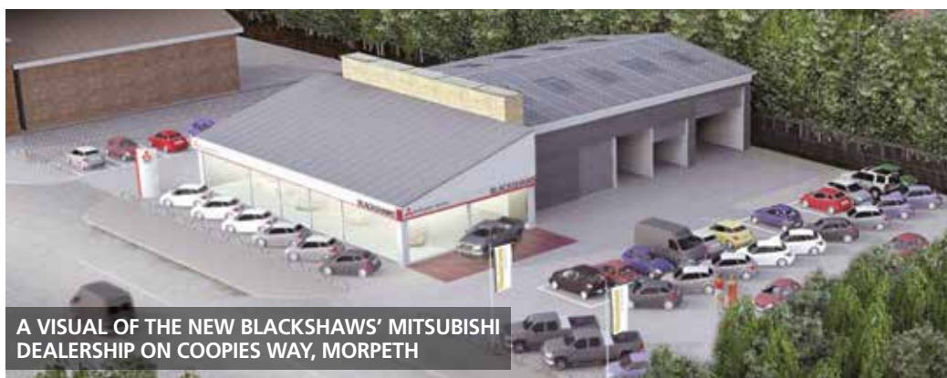
A VISUAL OF THE NEW BLACKSHAW'S MITSUBISHI DEALERSHIP ON COOPIES WAY, MORPETH