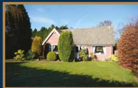
Longmeadows, Darras Hall