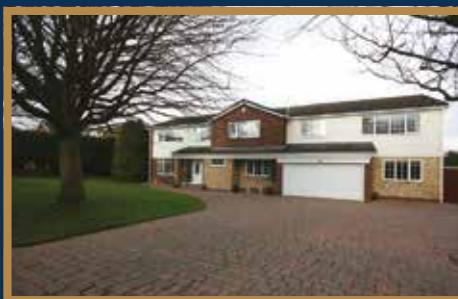
Wentworth Court, Darras Hall