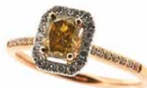
Bespoke 18ct rose gold natural 'cinnamon' coloured diamond ring