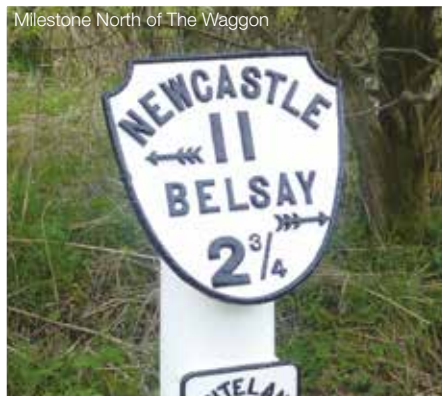
Milestone North of The Waggon