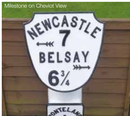
Milestone on Cheviot View