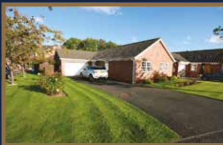
Paddock Hill, Ponteland