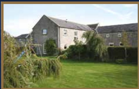
The Forge, Heddon on the Wall