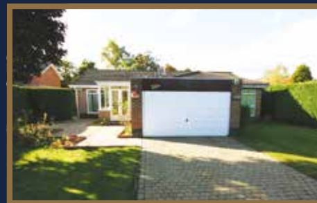
Willow Place, Darras Hall