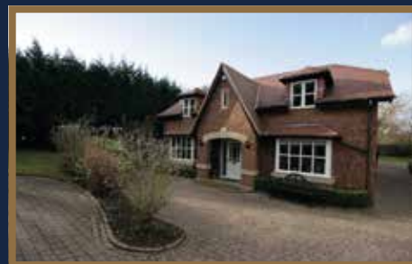
Darras Road, Darras Hall

OFFERS INVITED BETWEEN £375,000 - £395,000