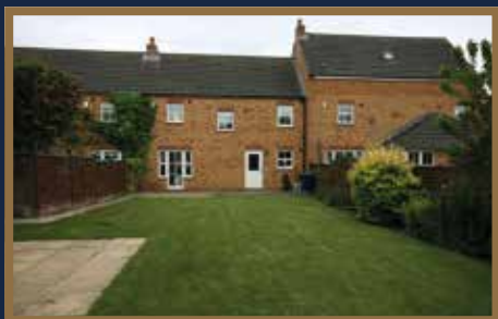
Barmoor Drive, Gosforth