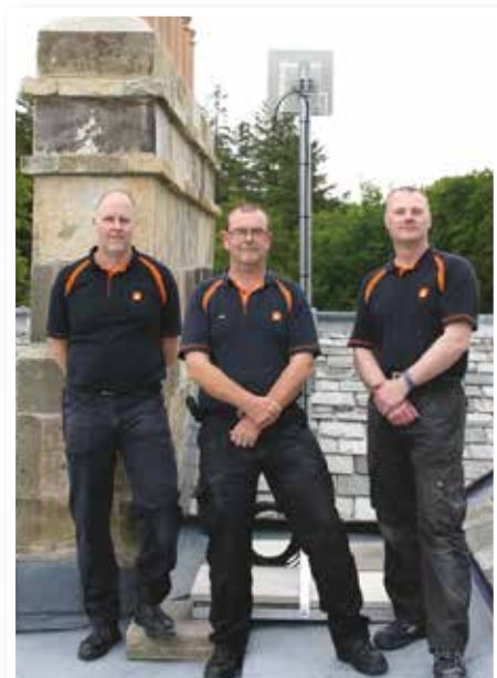
Staff of KBR IT & Network Solutions Ltd Birtley on the roof at Dissington Hall

Establishing Dissington Hall as an Enterprise Hub is part of the planned exit from the wedding market and a move to concentrate on providing all the facilities that are required by small business. The Hub has meeting rooms and conference facilities and is already a thriving community of diverse companies.