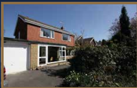
Woodside, Darras Hall