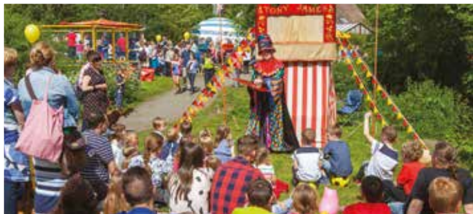
Children enjoy Punch & Judy at last year's event.