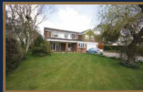
Beech Court, Darras Hall