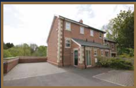
West Road, Ponteland