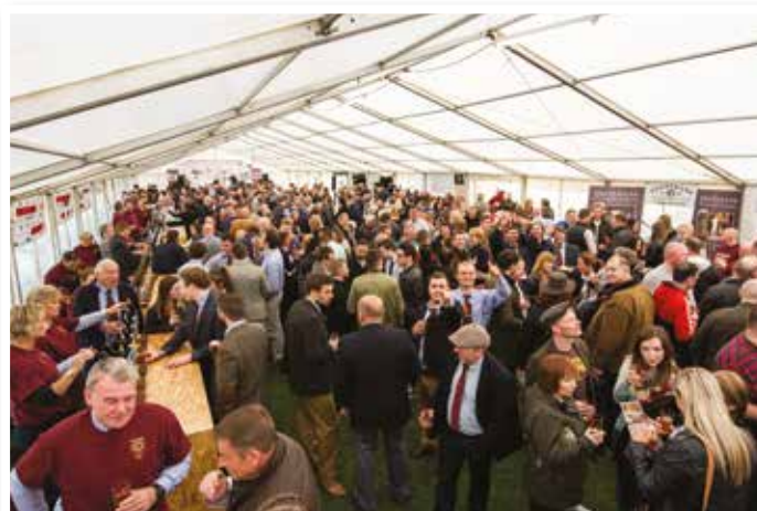
Twice as many beers and twice as many people at this year's beer festival.