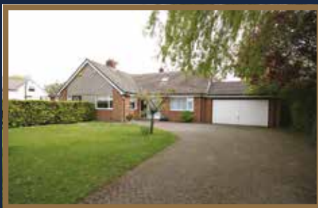
Longmeadows, Darras Hall