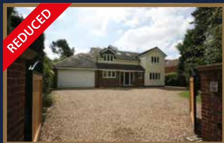
Middle Drive, Darras Hall