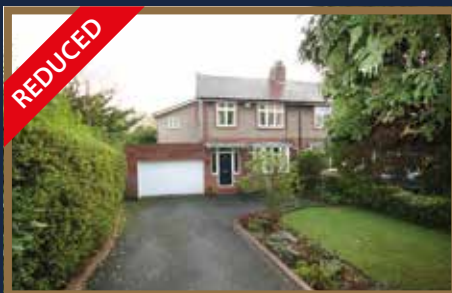
Darras Road, Darras Hall

Offers Invited Between: £699,950 - £720,000