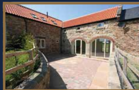
Unit Two, West Thorn Farm