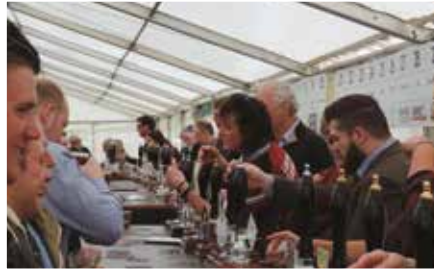
Revellers enjoy the beer at last year's inaugural festival

"The support we have had from local sponsors has been absolutely superb and has enabled us to double the number of beers that will be on sale compared to 2014; the aim being to have in excess of 75 beers as well as 25 different ciders."