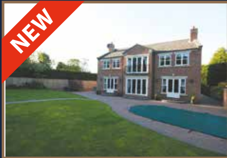
The Drey, Darras Hall