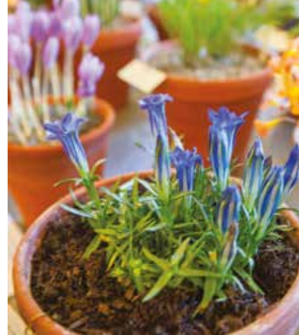
Gentiana sino-ornata , exhibitor not known.