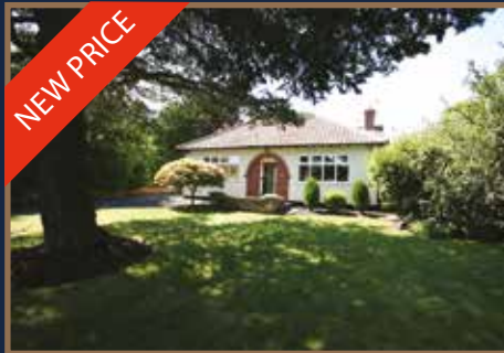
Woodside, Darras Hall