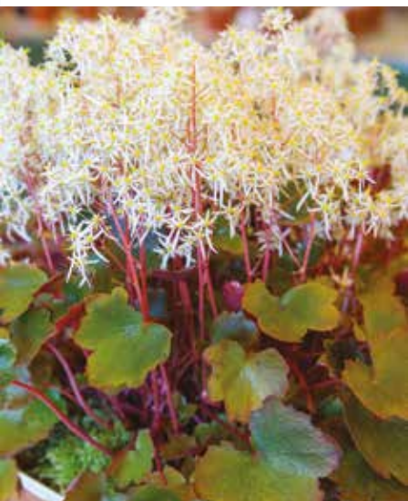
Saxifraga fortunei 'Rubrifolia' shown by Tom Green, Rowlands Gill.