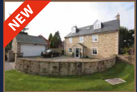
The Nursery, Medburn