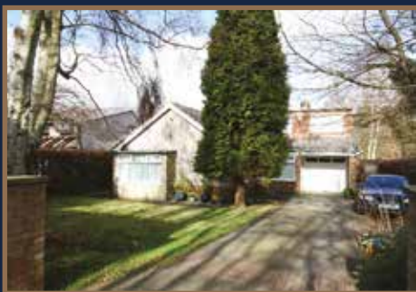
Edge Hill, Darras Hall