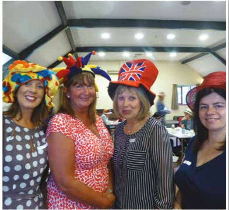
Four mad hats ready to party!

They use email and Facebook to spread their message and welcome any women who seek social contact and share a very varied programme of speakers and activities once a month. They meet on the second Tuesday of each month in St Mary's Church Hall.