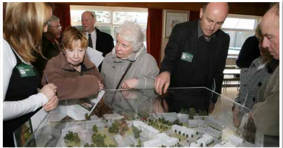
Residents at the February 2009 public exhibition.

The county council responded saying it needed to be "assured that there is a sound scheme and business case in place" before proceeding and issued an ultimatum and deadline for receipt of a new business plan from MKP by May 1, 2013. Without this, the council would "proceed to consider other options for the regeneration of Merton Way".