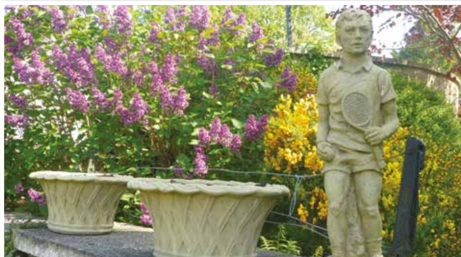
Flowering shrubs and sculpture in a corner of the garden

Eland Green Garden is open from 11am – 4.30pm on Sunday July 13th. None of