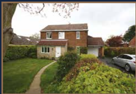
Edge Hill, Darras Hall