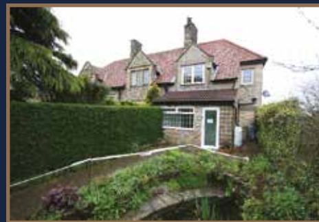
Military Road, Heddon-On-The-Wall