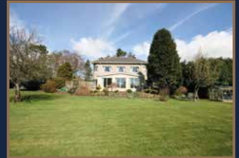
Western Way, Darras Hall