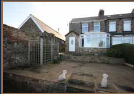
Dene Terrace, Ovington