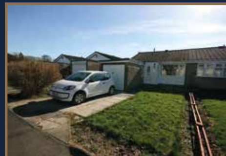
Dunsley Gardens, Dinnington