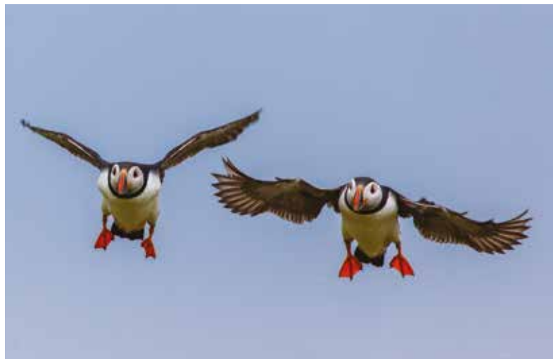
Cover shot: Bill Norfolk's winning photograph of a pair of puffins landing.