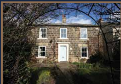
Bell Villas, Ponteland