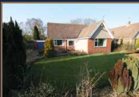
Longmeadows, Darras Hall