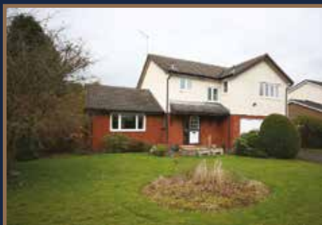
Ladyrigg, Darras Hall