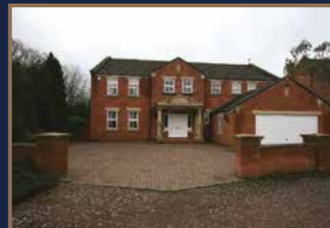
The Drey, Darras Hall