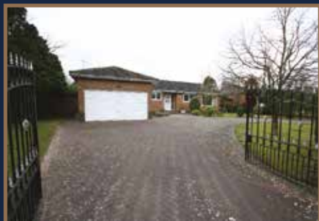
Collingwood Crescent, Darras Hall