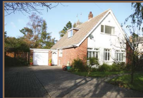
Longmeadows, Darras Hall