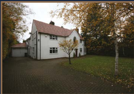
Darras Road, Darras Hall