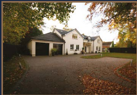
Edgehill, Darras Hall