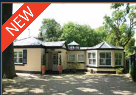
South Drive, Woolsington