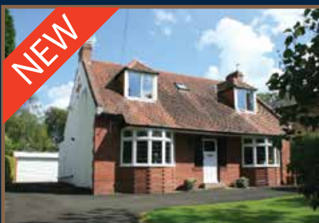
Western Way, Darras Hall