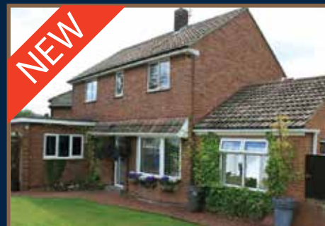
Ridgely Drive, Ponteland