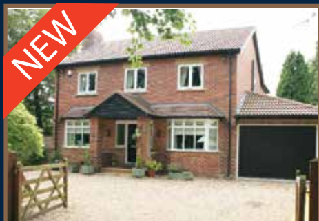
The Crescent, Darras Hall