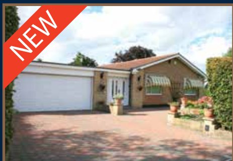
Pembroke Drive, Darras Hall