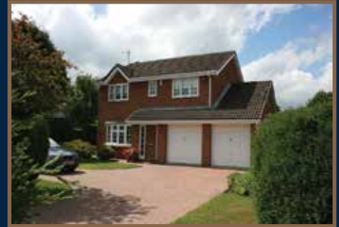
Whinbank, Darras Hall