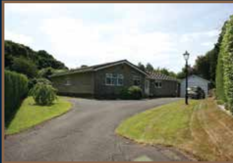
Hill Park, Darras Hall