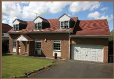
Edge Hill, Darras Hall