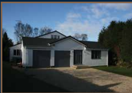
Ashdale, Darras Hall