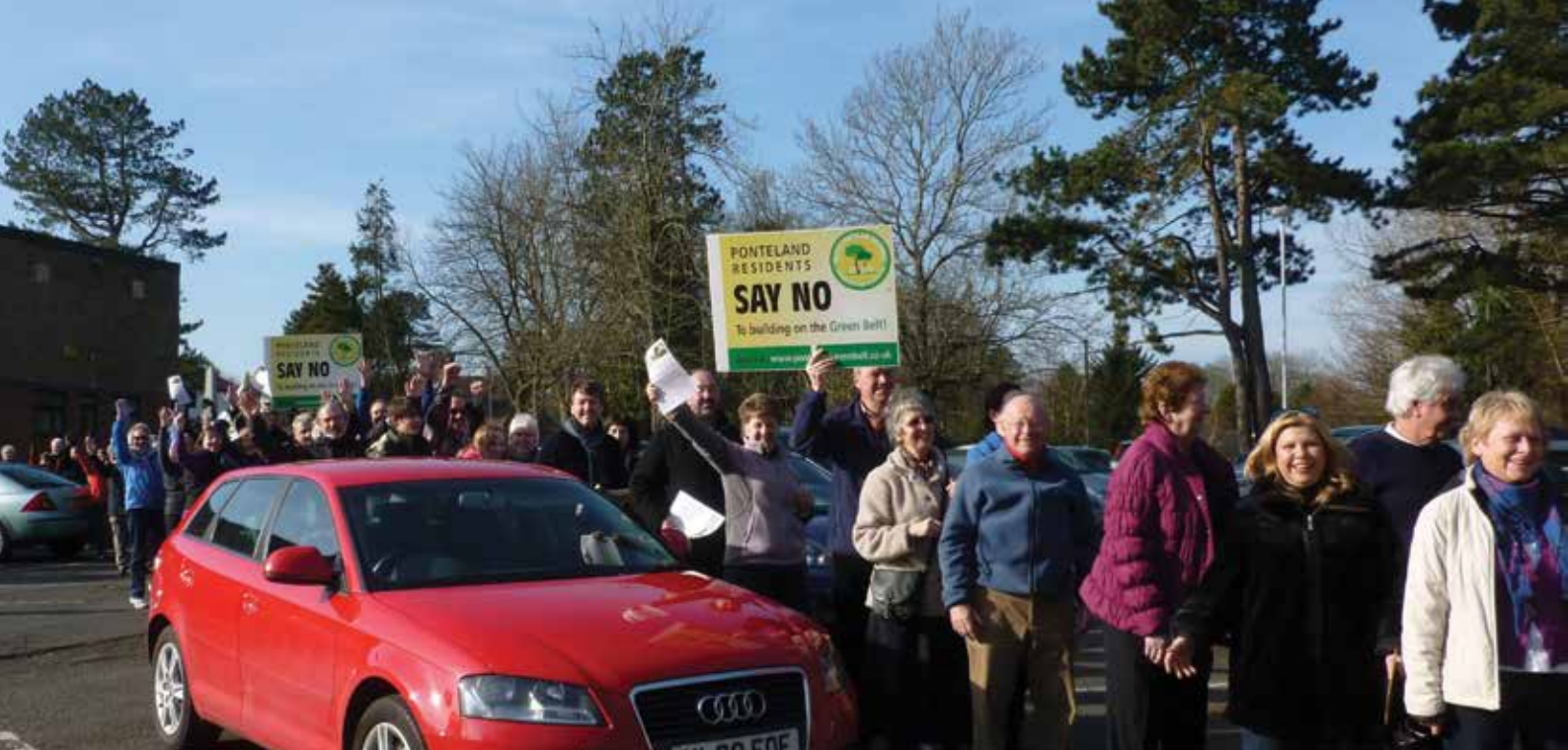
Volunteers queue to help distribute the green belt campaign information packs.