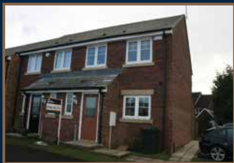
The Lairage, Ponteland