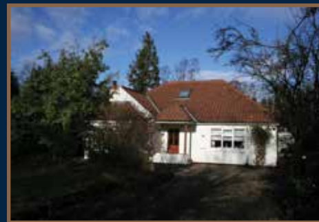
Darras Road, Darras Hall