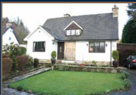
Darras Road, Darras Hall