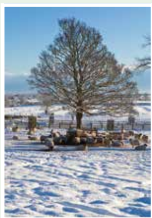
Cover shot: Sheep in the snow at Kirkley Hall

This report is based on the minutes of the Town Council meeting held on December 12.