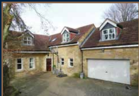
Medburn Lodge, Medburn