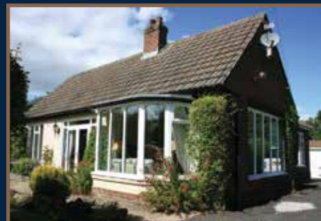
Middle Drive, Darras Hall