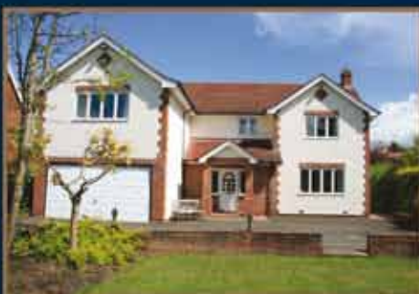
Western way, Darras Hall