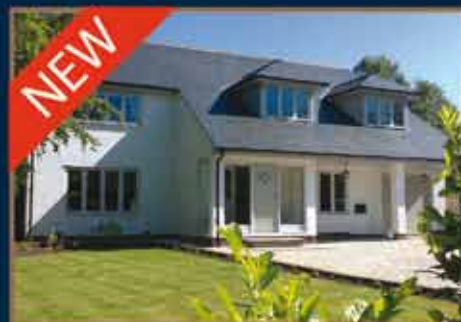
Middle Drive, Darras Hall