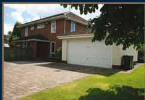
Wentworth Court, Darras Hall