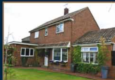
Ridgely Drive, Ponteland