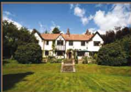
Shaftesbury House, Riding Mill