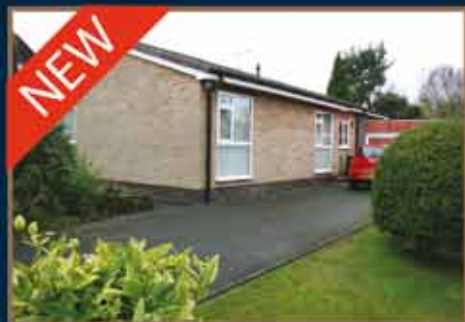
Errington Road, Darras Hall