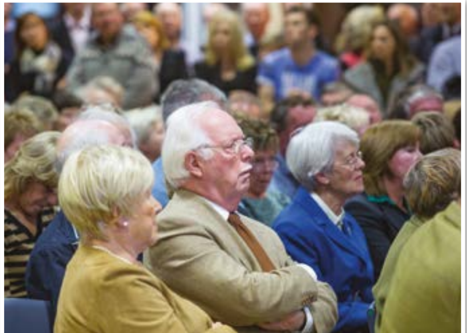
Residents at the packed public meeting in October.

A site visit by planning officers and committee members in October attracted 250 placard wielding campaigners, while an estimated 550 residents attended a packed two-and-a-half hour public