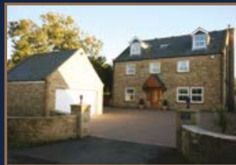
Meadow View, Medburn