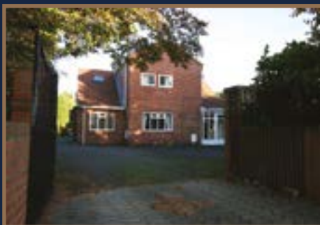
Western Way, Darras Hall