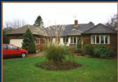
Edgehill, Darras Hall