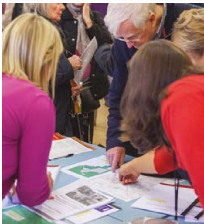
Residents are shown proposals at the Ponteland consultation event.

Hundreds of residents attended a consultation event where controversial plans to “delete” parts of Ponteland’s Green Belt were presented by county council planners.