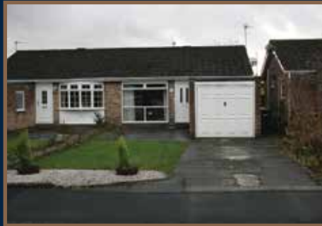
Church Close, Dinnington