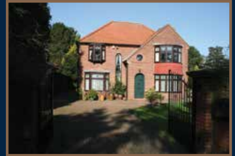
Darras Road, Darras Hall