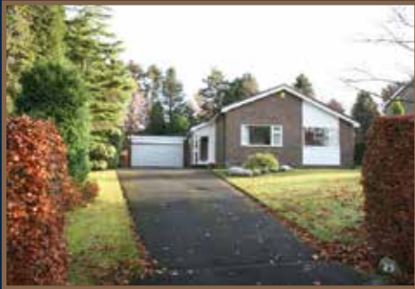
Beech Court, Darras Hall