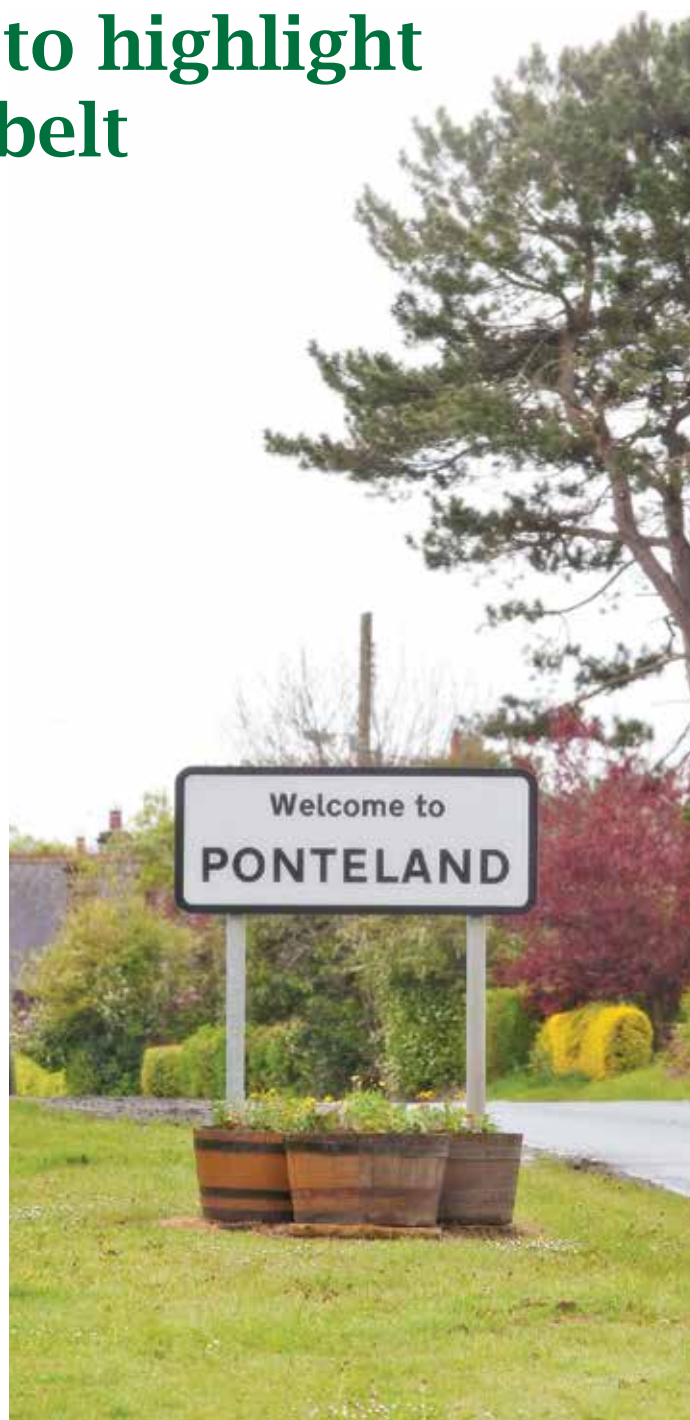
Is Ponteland's semi rural character under threat?

We look forward to your involvement and receiving your comments.