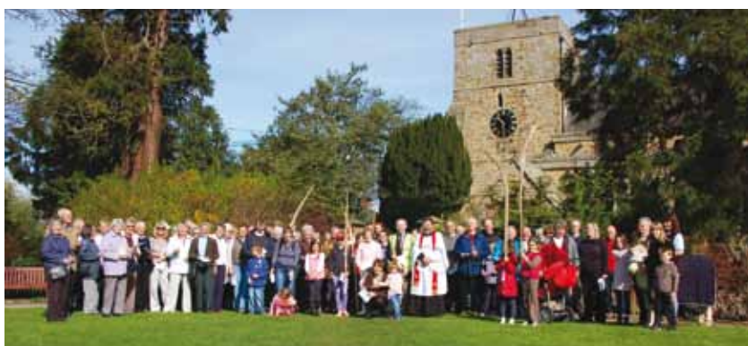
Palm Sunday 2011