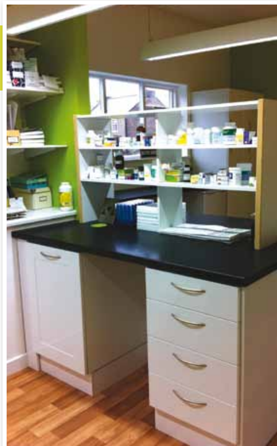
The new upstairs extension at Taylor's Pharmacy

To find out more about delivery of prescriptions, veterinary products or any other services provided by the pharmacy call (01661) 822055.