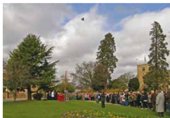
Good Friday 2010